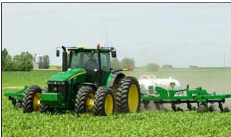
The No. 1 way to increase nitrogen efficiency is to shift to a sidedress application," McGrath says. "

"I suspect there was no change in the C:N ratio because nitrogen can easily be washed off from the residue with rain," he said. "This is important when considering applicability of these results to Illinois. It is possible that cooler temperatures that occur earlier in the fall in Wisconsin may not reflect Illinois conditions. However, C:N ratio measurements are largely independ-